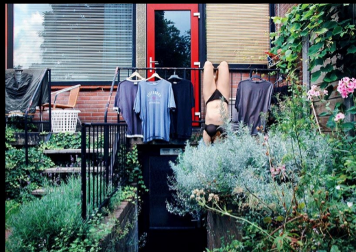
Doing the Laundry

Anton Corbijn, Guy Bourdin I admire, but my inspiration comes from my life. From what I go through and what I see around me. My self-portraits are my diary.